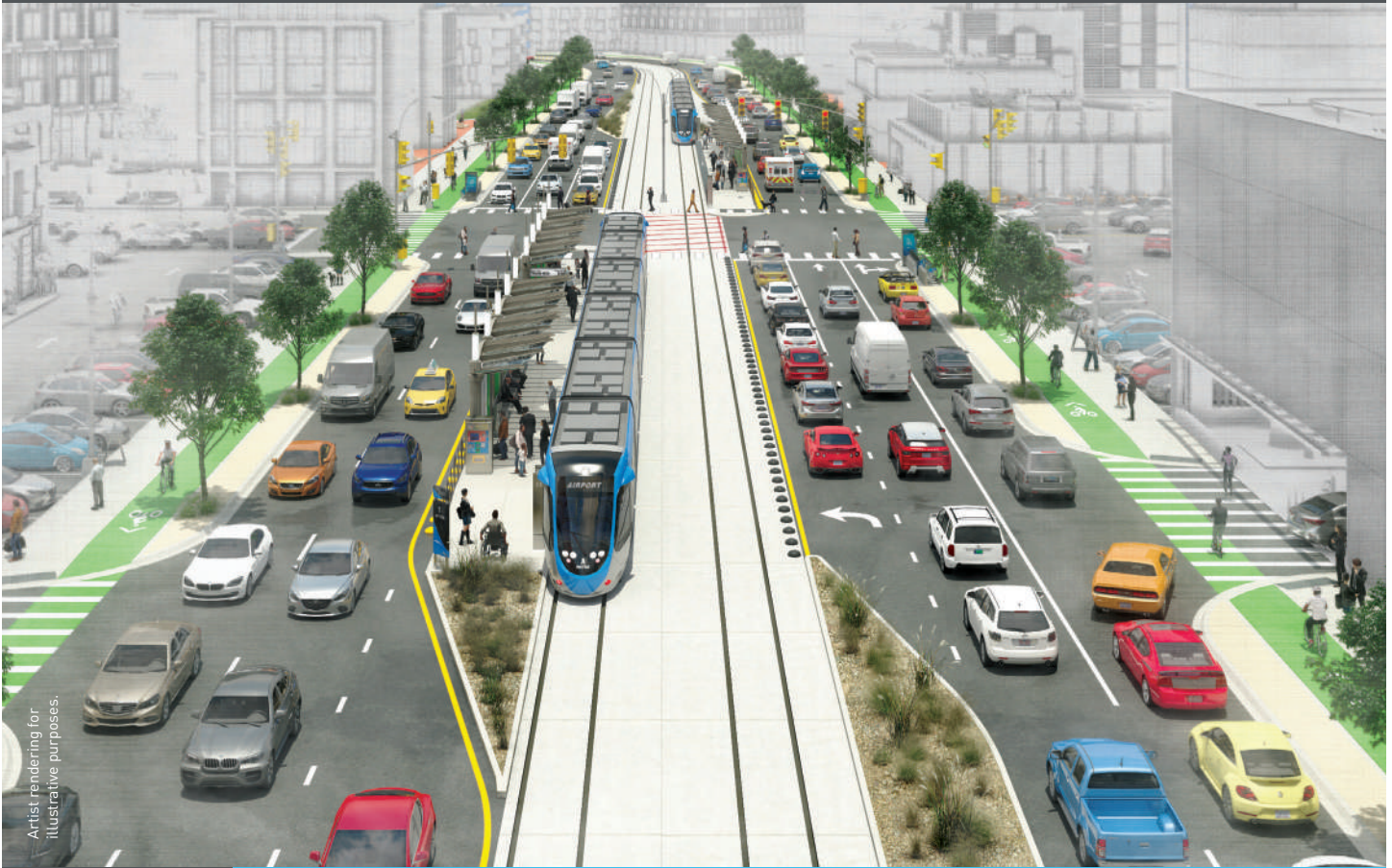
Artist rendering for illustrative purposes.